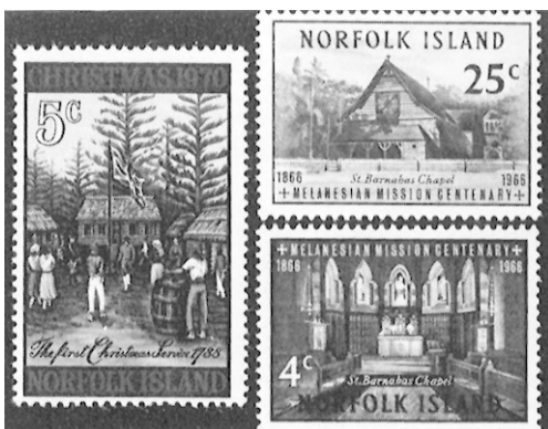
The Island's postage stamps often illustrate Christian themes: (left) the first Christmas service, 1788; (right) St. Barnabas Chapel, exterior and interior.

Country status. Norfolk Island, an external territory of Australia since 1913, is an island in the Pacific Ocean off the east coast of Australia. The island was originally settled by descendants of the mutineers from the Bounty .