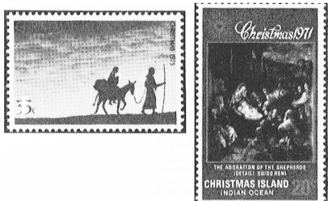
Over half of the Island's postage stamps have celebrated the birth of Christ, including The Flight into Egypt (1975).

CATHOLIC CHURCH. The Holy See has no diplomatic relations with Christmas Island in AD 2000. Indigenous missions. There is virtually no missionary outreach from the Christmas Islands.